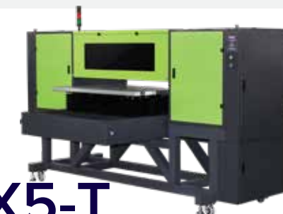
X5 & X5-T